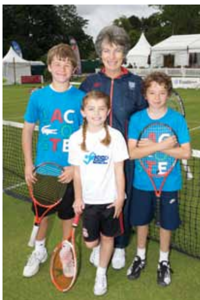
VIRGINIA WADE WITH THE YOUNG STARS OF THE FUTURE AT THE 2011 LIVERPOOL TOURNAMENT

Northern Vision’s tennis academies will operate in local clubs and schools, our programmes and coaches will work with existing infrastructures, coaches and talent to expand and enhance the coaching programmes in clubs throughout Merseyside to create thriving facilities at the heart of local communities and introduce tennis to the widest possible audience.